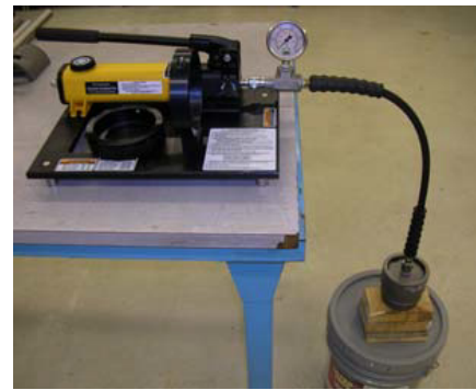
Swaging Head Positioned Below Pump